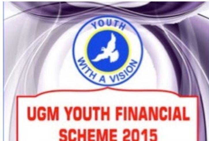
The badge, proudly worn by members of the UGM Youth Financial Scheme

In 2015, from the runner's fundraising, we launched the UGM Youth Finance Scheme. This saw 11 young people complete 3 month apprenticeships in relevant local businesses in Masaka, keeping a daily diary and writing a business plan. 2015 runners ran business training for the youth, giving them marketing and business strategy advice from their personal experiences.