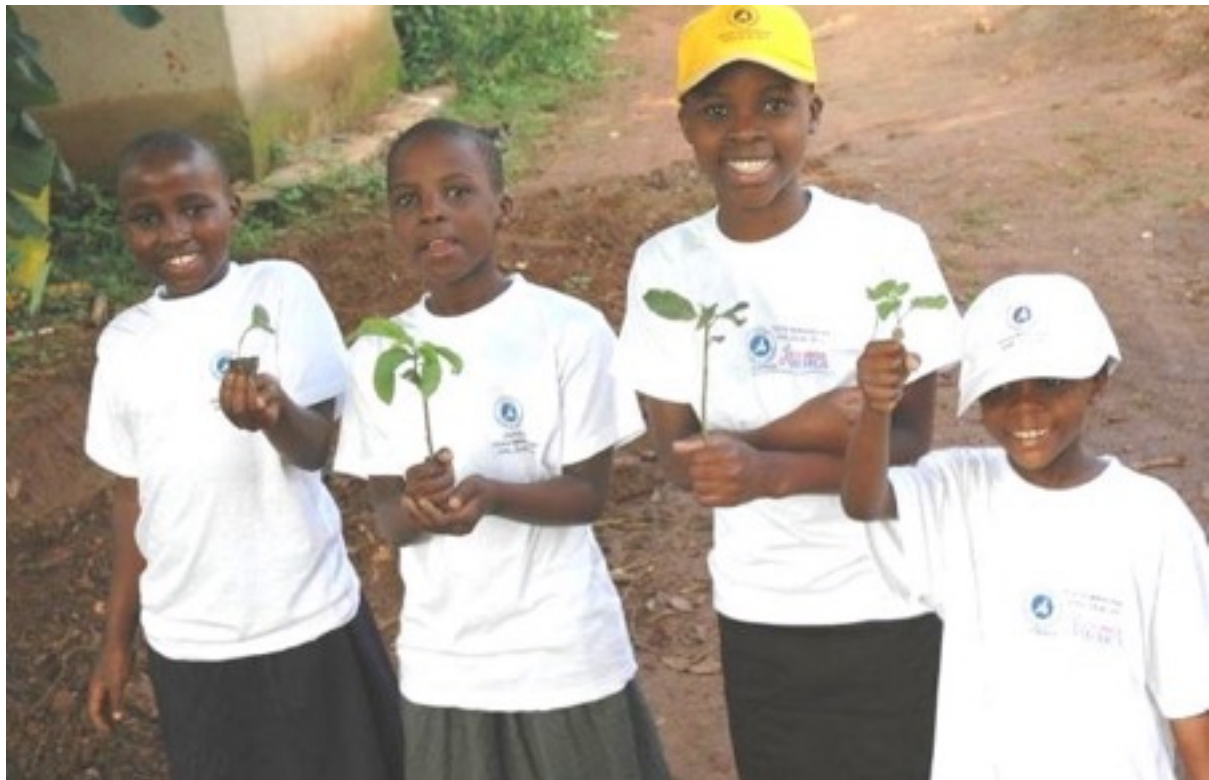
Members of Youth With a Vision, Masaka

Youth with a vision is a community based youth network in Masaka district, solely and comprehensively embracing young people from all backgrounds. Their objective is to advance the education of young people and their communities in areas of academic, health/HIV/AIDS awareness, environment, human rights, poverty reduction strategies, job creation and employment skills, civic engagement, provision of facilities for recreation and other activities in the interest of social welfare.